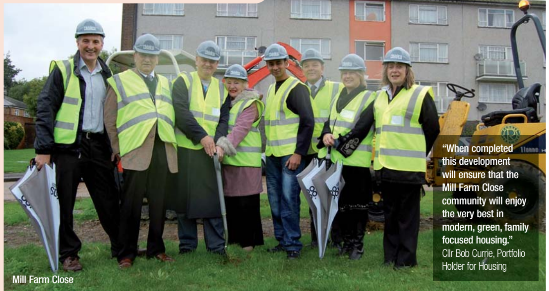
Mill Farm Close