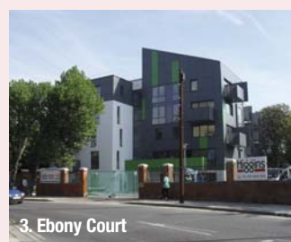
3. Ebony Court