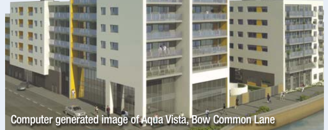
Computer generated image of Aqua Vista, Bow Common Lane