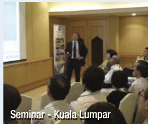
Seminar - Kuala Lumpur

With over a third of the site already sold Higgins Homes are in a fantastic position to formally launch the site in the UK on the 9th October.