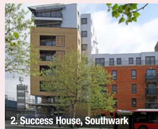
2. Success House, Southwark