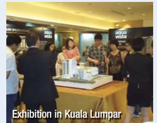
Exhibition in Kuala Lumpur