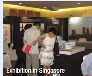
Exhibition in Singapore