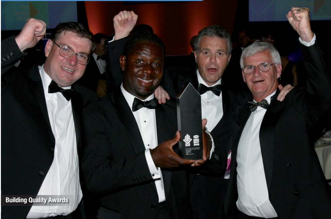
Building Quality Awards