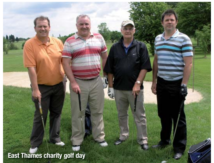
East Thames charity golf day