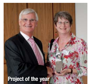
Project of the year