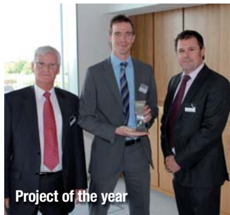
Project of the year