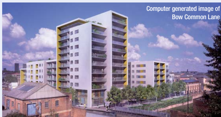
Computer generated image of Bow Common Lane

"The housing market has been very turbulent over the last few years but we are certainly seeing the light at the end of the tunnel and our decision to purchase these exciting new sites shows our confidence in the current market. These sites include our new flagship development at Aqua Vista, Bow Common Lane, Bow, E3 which is a