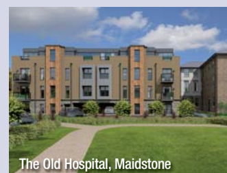
The Old Hospital, Maidstone

properties. The future also looks good as we continue to buy land, are looking at developing further joint ventures with Higgins Construction and our Housing Association partners, and are currently building on 5 further sites; Stevenage, Battersea, Maidstone, Hither Green and Coggeshall - so there will be more quality homes available to sell!