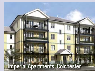
Imperial Apartments, Colchester