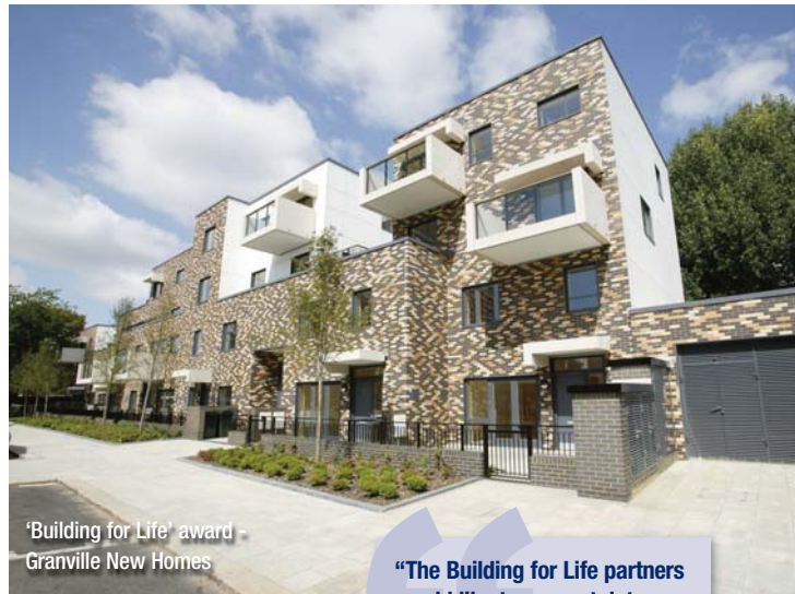
'Building for Life' award - Granville New Homes

"The Building for Life partners would like to congratulate you for committing to good design at Granville New Homes."