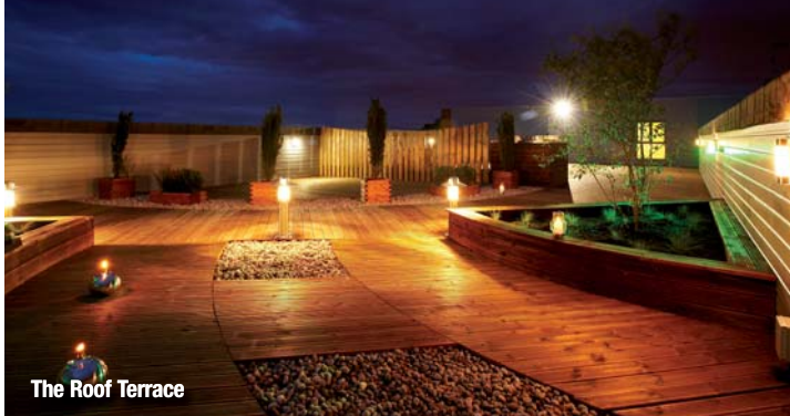
The Roof Terrace

The Roof Terrace, Higgins Homes' boutique development in Woodford Green, Essex, has been awarded a silver medal by the prestigious Daily Express New Homes Garden Awards.