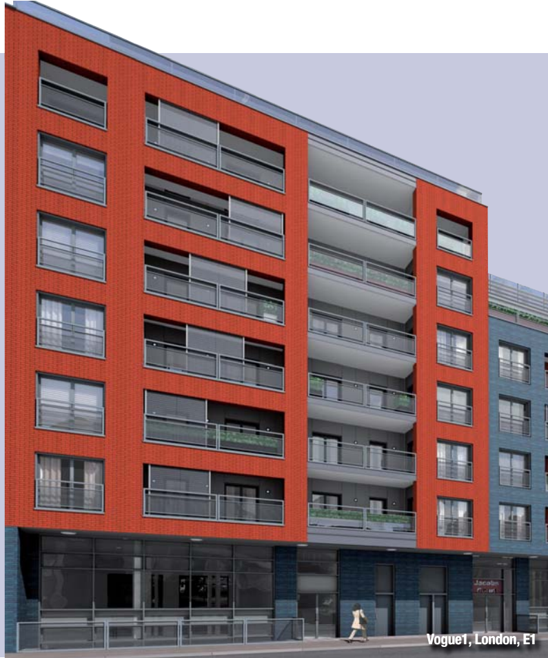
Vogue1, London, E1

Prices start at £294,950 for one bed and £375,000 for two beds