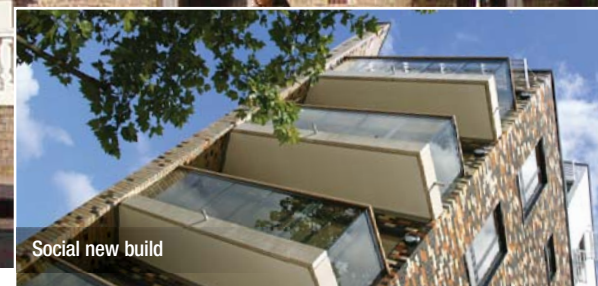
Social new build