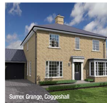
Surrex Grange, Coggeshall

If house buyers are looking at new flats, penthouse apartments or houses - one thing they can be sure of is that Higgins Homes can help them find their ideal, high quality new home in one of many exciting new developments.