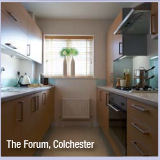
The Forum, Colchester