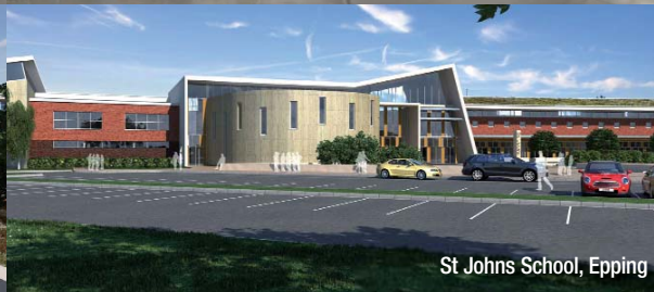
St Johns School, Epping

Higgins Construction are delighted to report that there are many exciting and innovative opportunities for the organisation this year. With our expertise in specialised areas we are well equipped to work in partnership with a range of clients.