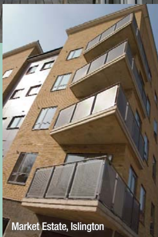
Market Estate, Islington

works across the estate. This work was the first of four phases to complete a comprehensive £40M regeneration of the Market Estate. The works are being carried out in a 'live' estate environment with demolition and new build being undertaken in close proximity to existing residential blocks. Resident communication and consultation is key to project success and we have community and resident liaison staff based on the site.