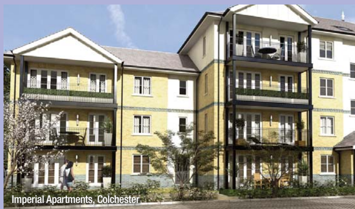
Imperial Apartments, Colchester