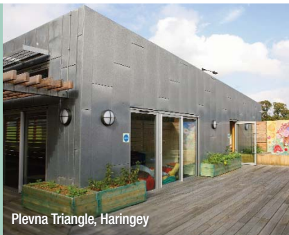
Plevna Triangle, Haringey

Whilst working within the clients financial constraints Higgins constructed England's largest eco friendly high tech children's play centre.