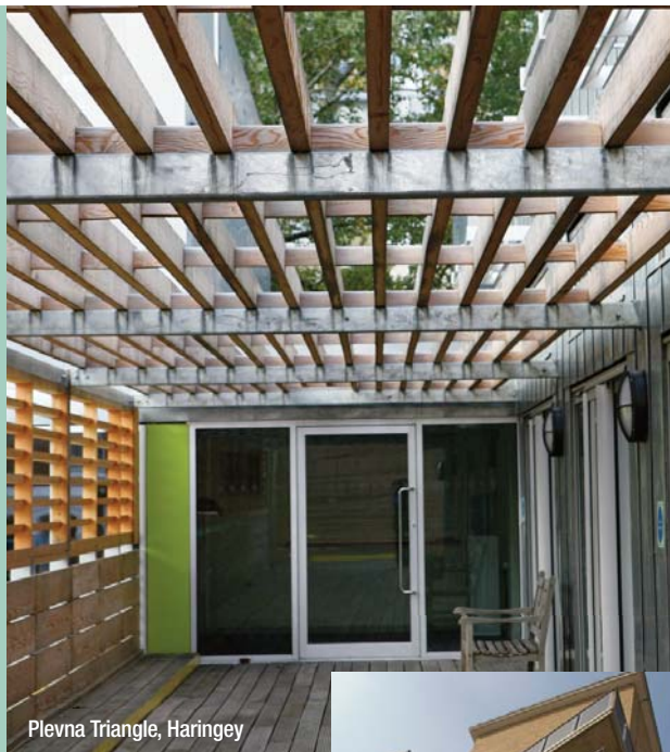
Plevna Triangle, Haringey

works across the estate. This work was the first of four phases to complete a comprehensive £40M regeneration of the Market Estate. The works are being carried out in a 'live' estate environment with demolition and new build being undertaken in close proximity to existing residential blocks. Resident communication and consultation is key to project success and we have community and resident liaison staff based on the site.