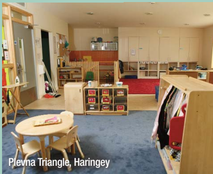
Plevna Triangle, Haringey

The ground floor of the centre was built for children aged 0-6years, with the first floor catering for 6-13 year olds.