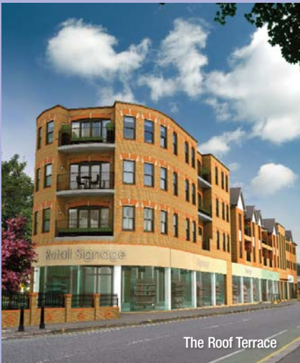
The Roof Terrace

contract: extension complete with solar shading, under-floor heating, and high specification lighting and IT equipment providing space for admission of senior school pupils