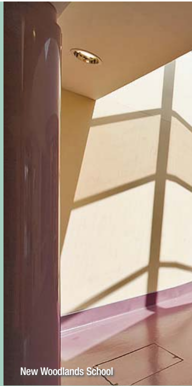
New Woodlands School

phase 1: teaching and administration block completed