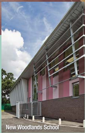
New Woodlands School

Parchmore Road - Surrey client: Arawak Development value: £3.5M contract: 30 flats, 1 house, 1 ground level commercial unit - 10 flats for rent, 20 for shared ownership