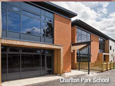
Charlton Park School

Parchmore Road - Surrey client: Arawak Development value: £3.5M contract: 30 flats, 1 house, 1 ground level commercial unit - 10 flats for rent, 20 for shared ownership